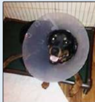
Still smiling, in spite of it all!