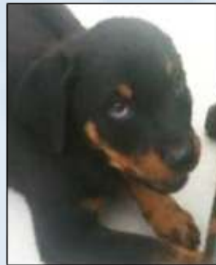
Me at 8 weeks of age

My surgeon says that my TPLO surgery was successful and that I’ll be off leash soon! I can hardly wait to get back to my friends at DogSpot. None of this has dampened my *sparkling* personality (have you ever seen a happier face in a cone??) and I’m so ready to bust out and play. I’ll be seeing everyone again soon!