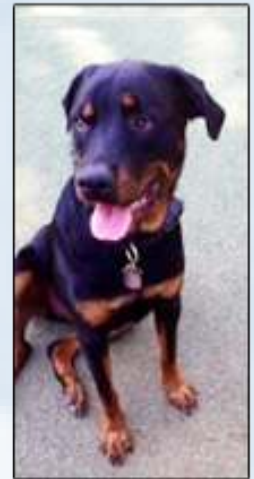
At one year of age, pretty handsome, right?